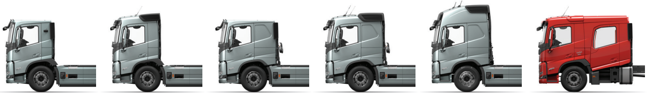
Low day cab